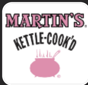
Pink Ribbon Awardee Martin's Potato Chips