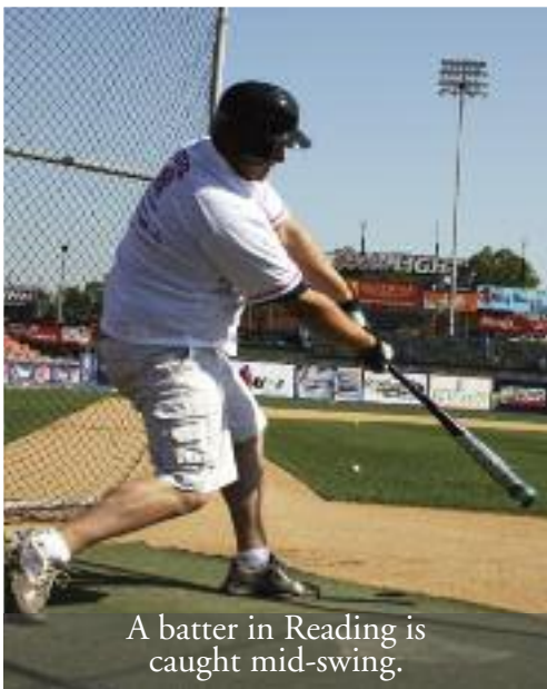
A batter in Reading is caught mid-swing.