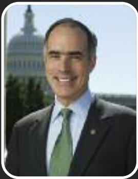
Pink Ribbon Awardee U.S. Senator Robert P. Casey, Jr.