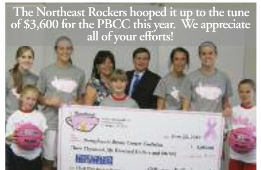
The Northeast Rockers hooped it up to the tune of $3,600 for the PBCC this year. We appreciate all of your efforts!