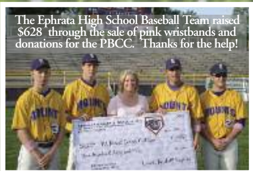
The Ephrata High School Baseball Team raised $628 through the sale of pink wristbands and donations for the PBCC. Thanks for the help!