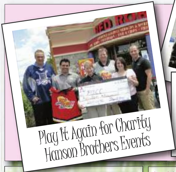
Play It Again for Charity Hanson Brothers Events