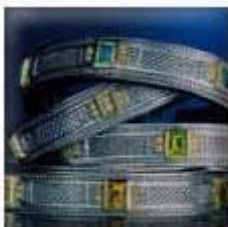
amitakaly JUDITH RIPKA TWO

Higashi Pearls invites you to "shop for the cure" with an exclusive preview of Judith Ripka's new jewelry collection. From August 16 through the 18, 10% of all purchases will benefit the PBCC. For more information, call Higashi Pearls at 717-303-0336.